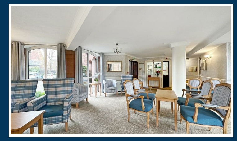
lan Macklin & Co, for themselves and the vendors or lessors of this property whose agents they are, give notice that ii the particulars are set out as a general outline only for the guidance of intending purchasers, and do not constitute, nor constitute part of, an offer or contract; iii all descriptions, dimensions, references to condition and necessary permission for use and occupation, and other details are given without responsibility and any intending purchasers should not rely on them statements or representations of the fact but must satisfy themselves by inspection or otherwise as to the correctness of each item; iii no person in the employment of lan Macklin & Co has any authority to make or give any representations or warranty whatsoever in relation to this property.