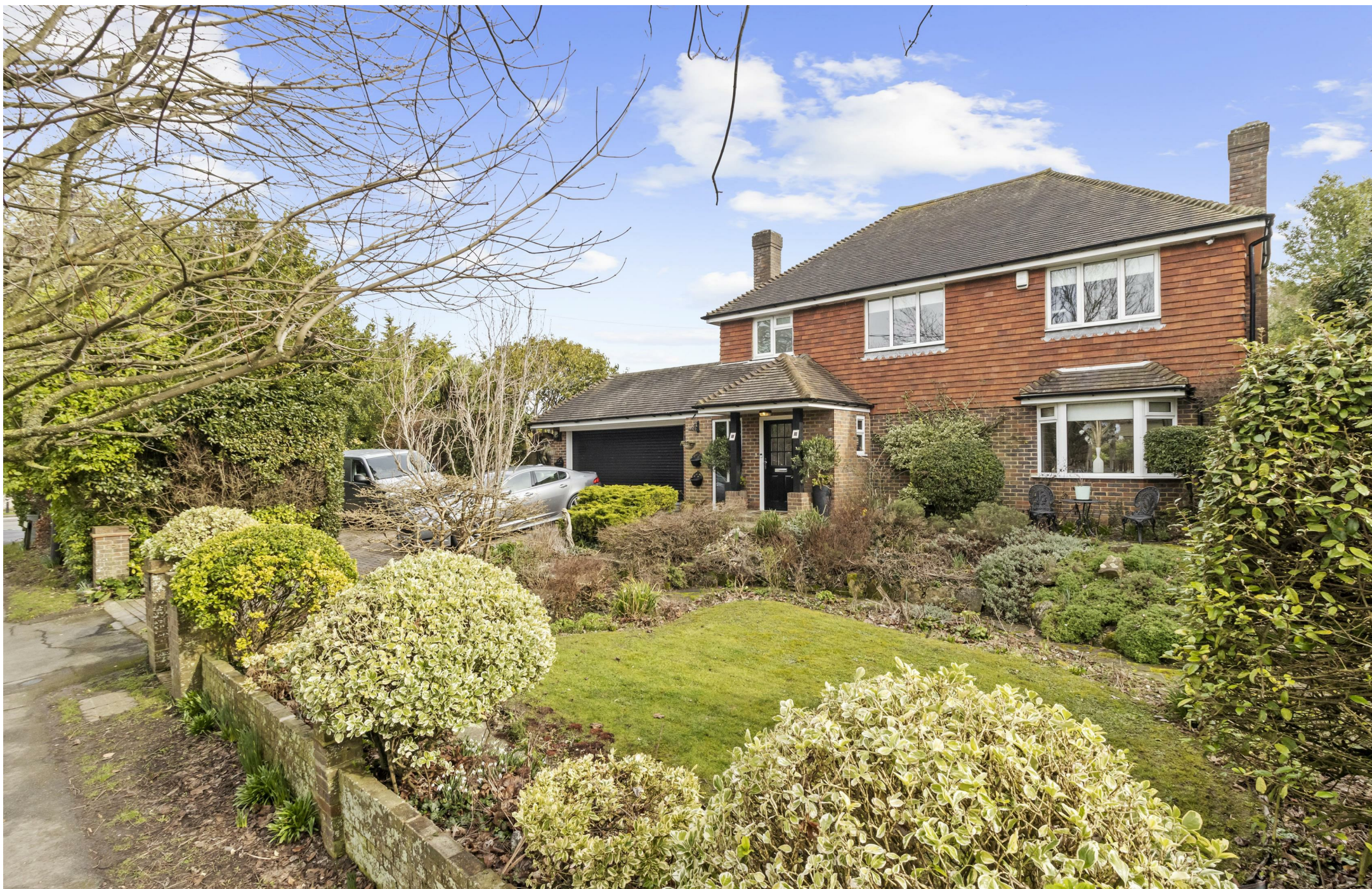
BIRLING HOUSE GILBERTS DRIVE, EAST DEAN, BN20 0DL