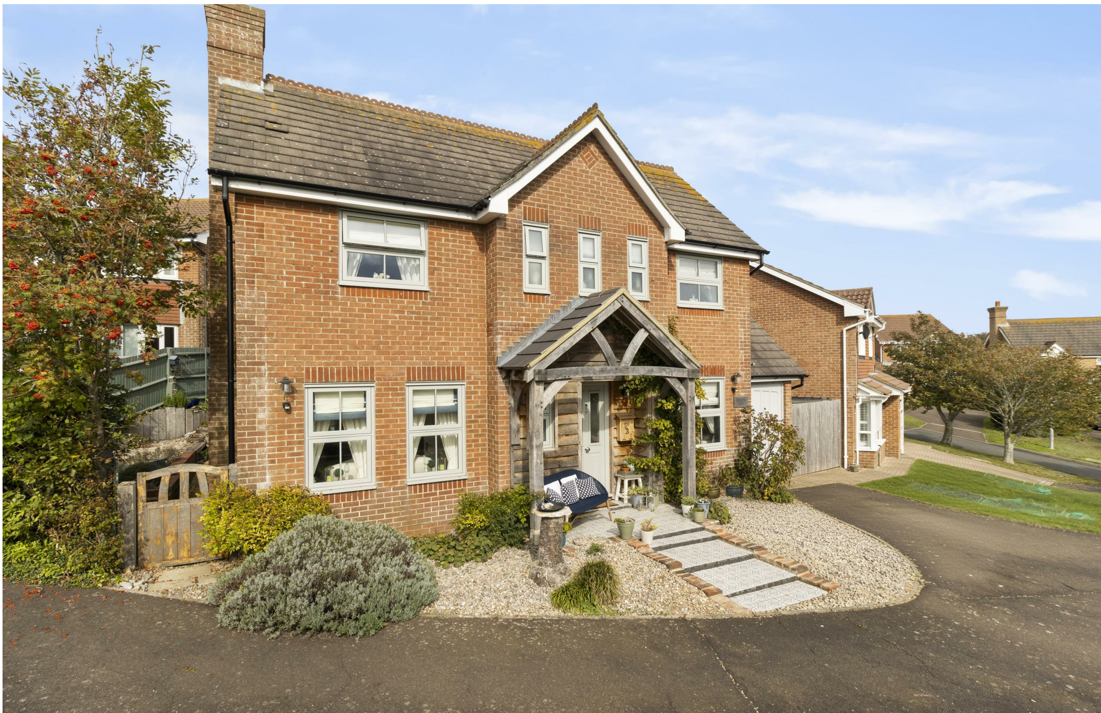
TETHERS END 3, ELEANOR CLOSE, SEAFORD, BN25 2XD