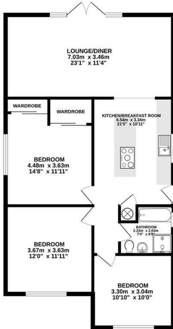
GROUND FLOOR 85.5 sq.m. (921 sq.ft.) approx.