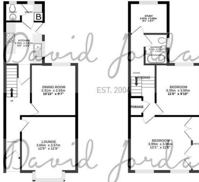
1ST FLOOR 41.3 sq.m. (445 sq.ft.) approx.