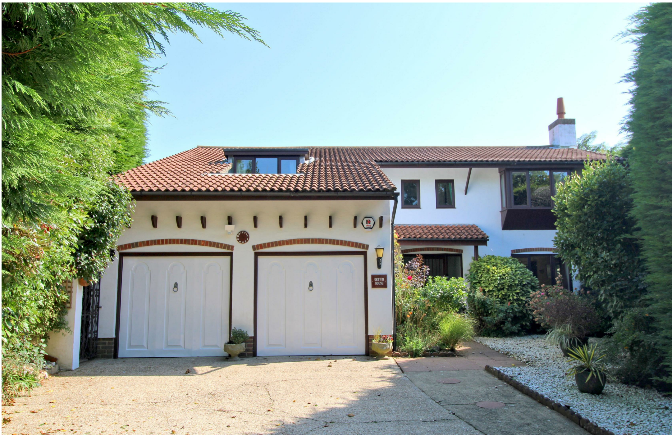
GRIFFIN HOUSE EASTBOURNE ROAD, SEAFORD, EAST SUSSEX, BN25 4BE