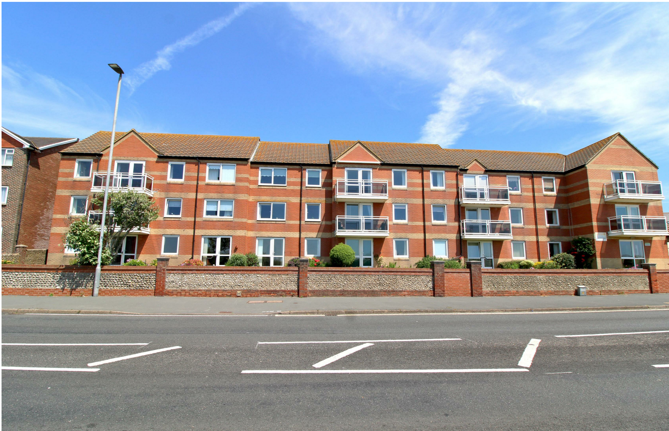
HOMETYE HOUSE, 64-66 CLAREMONT ROAD, SEAFORD, BN25 2BQ