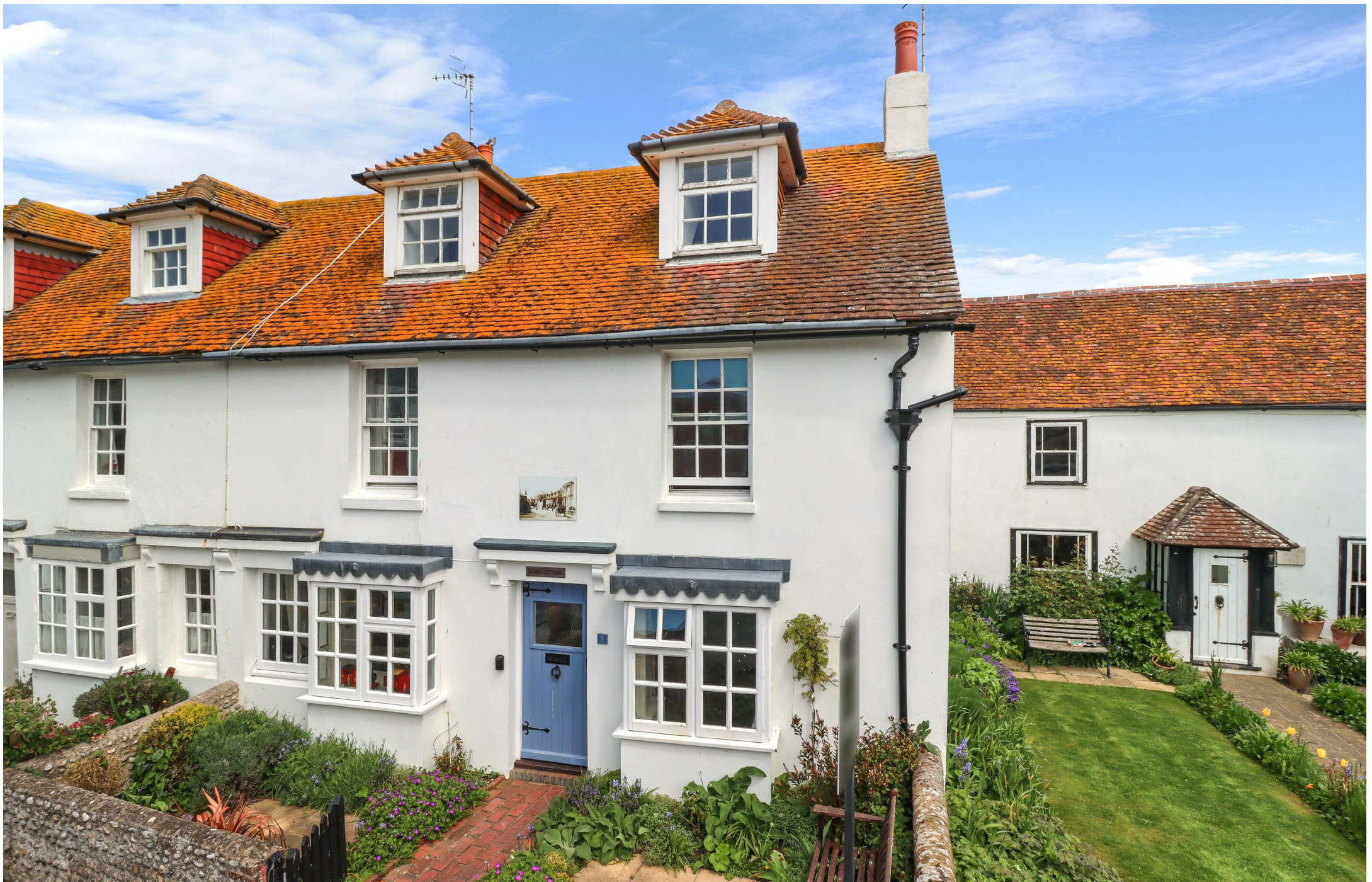
SAXON COTTAGE 3 SOUTH STREET, SEAFORD, EAST SUSSEX, BN25 1HS