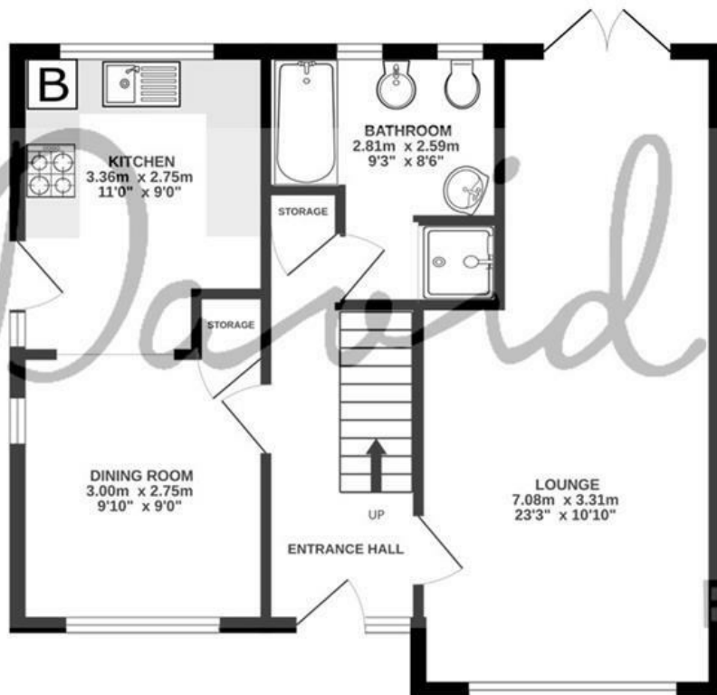
GROUND FLOOR 51.7 sq.m. (556 sq.ft.) approx.