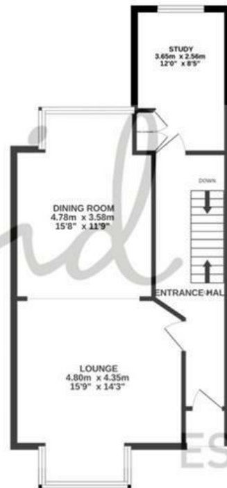
GROUND FLOOR 55.3 sq.m. (596 sq ft.) approx.