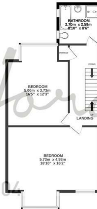
FIRST FLOOR 59.6 sq.m. (641 sq ft.) approx.