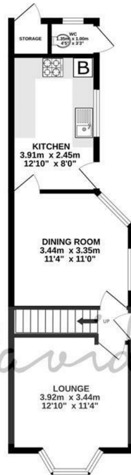
GROUND FLOOR 38.0 sq.m. (409 sq.ft.) approx.