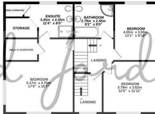
1ST FLOOR 80.4 sq.m. (865 sq.ft.) approx.