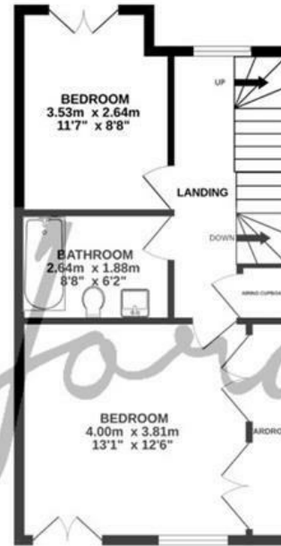
2ND FLOOR 41.8 sq.m. (449 sq.ft.) approx.