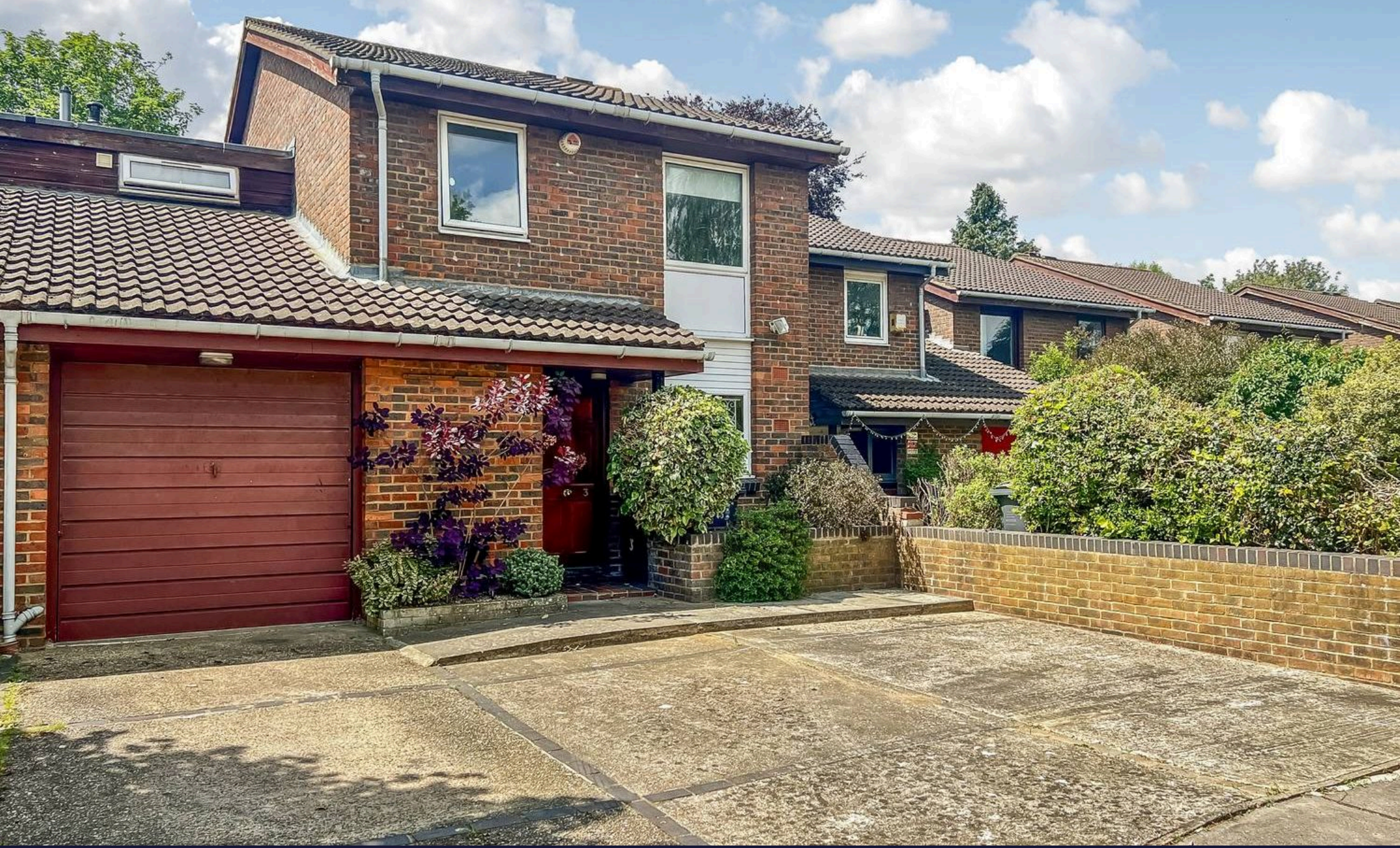
3 Lyndhurst Close, Park Hill, East Croydon PRICE £730,000 FREEHOLD