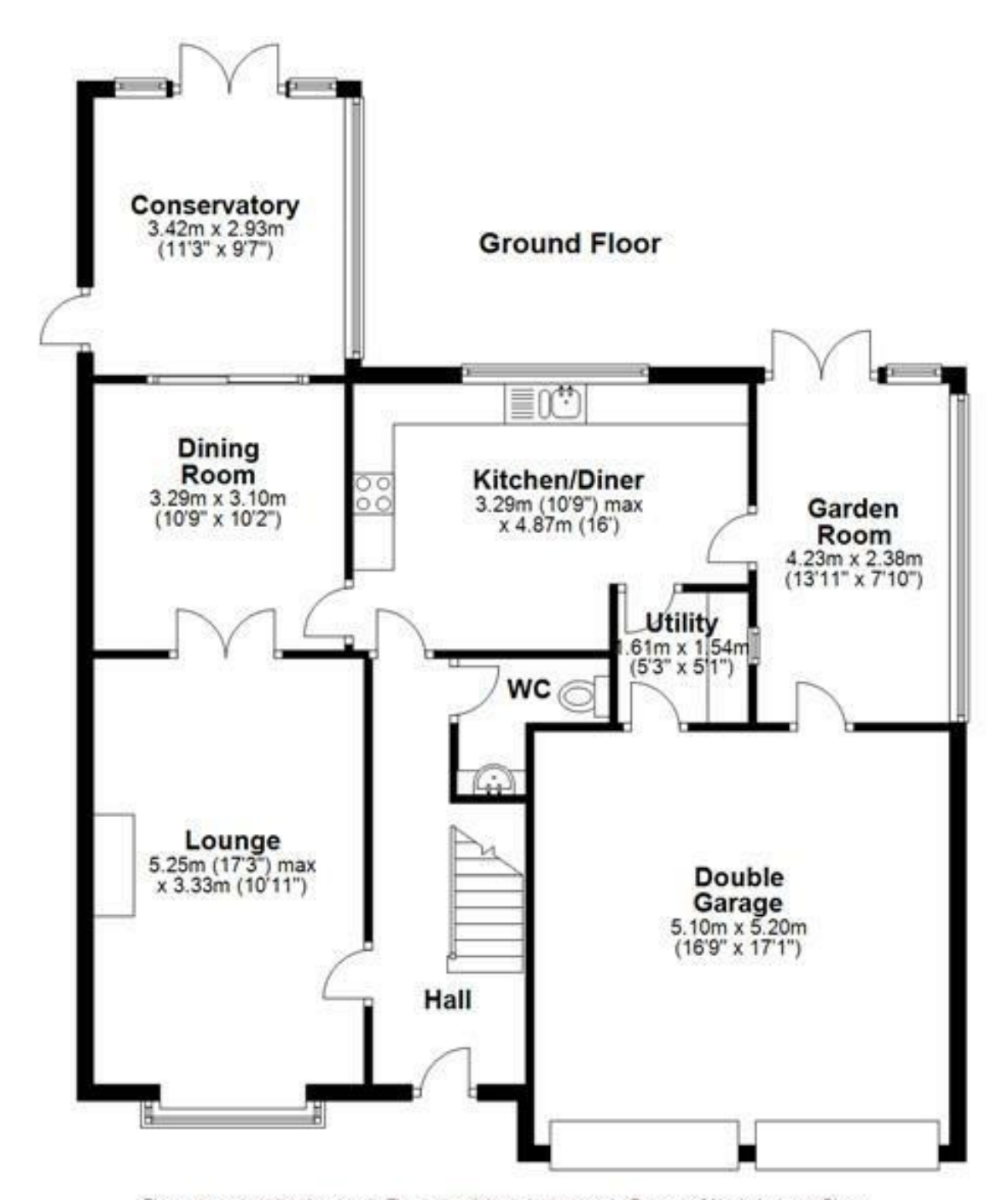
Please use as a guide to layout only. They are not intended to be to scale. Property of Abode Anderson-Dixon. Burton-Uttoxetter-Ashbourne Plan produced using PlanUp.