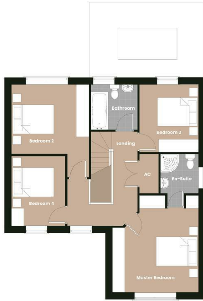
First Floor Plan - Plot 2