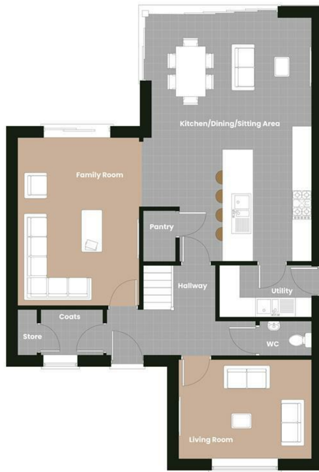
Ground Floor Plan - Plot 2