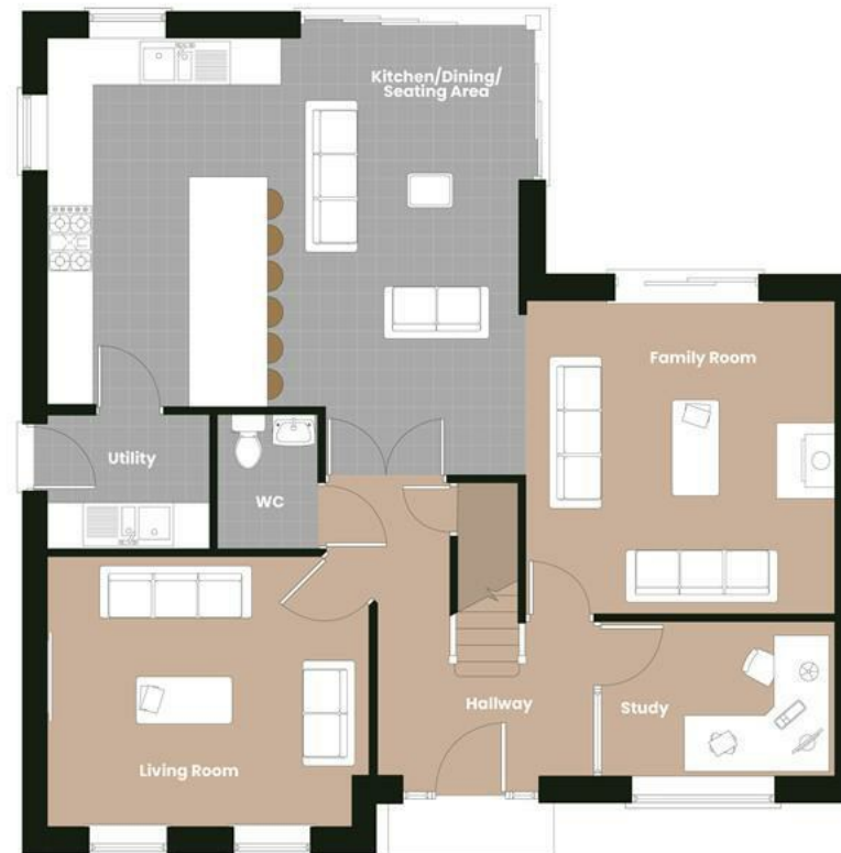
Ground Floor Plan - Plot 3