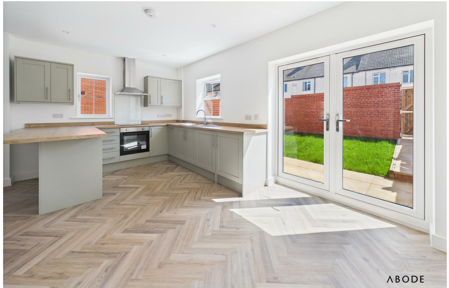
Enclosed garden with patio and lawn. Rear parking.