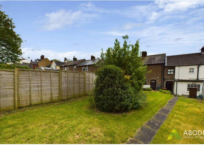
showcases a generously sized lawn garden adorned with a variety of trees and shrubs, a pathway leading to the garden shed.