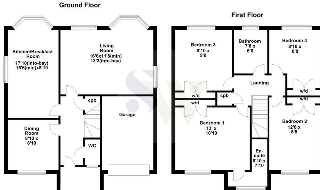
Floor plan not to scale - for guidance purposes only. Floor plan created by Simpson West for their use. Plan produced using PlanUp.