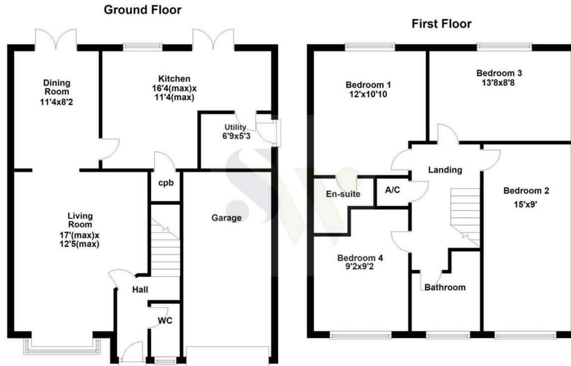
Floor plan not to scale - for guidance purposes only. Plan produced using PlanUp.