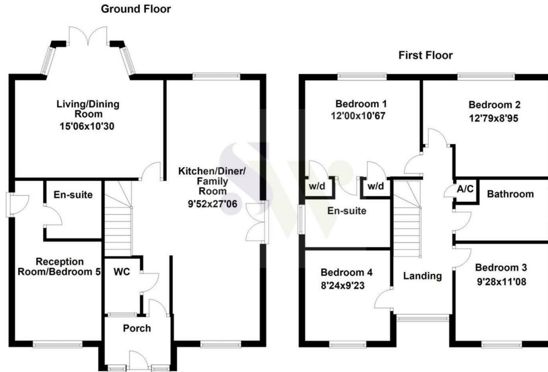
Floor plan not to scale - for guidance purposes only. Plan produced using PlanUp.