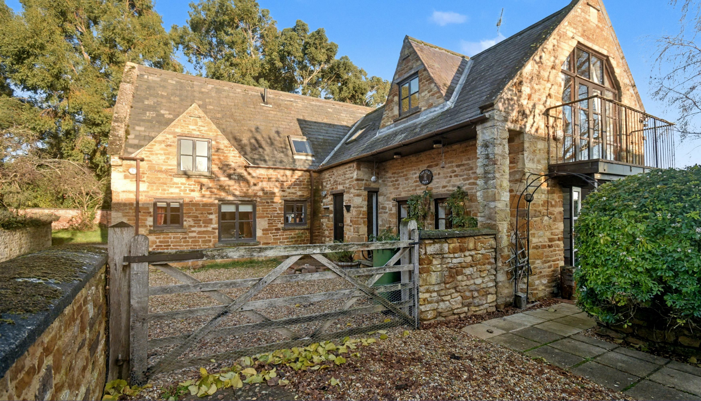
The Old Barn High Street Market Harborough, LE16 8ST