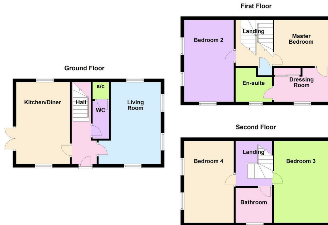
Floor plan not to scale - for guidance purposes only. Plan produced using PlanUp.