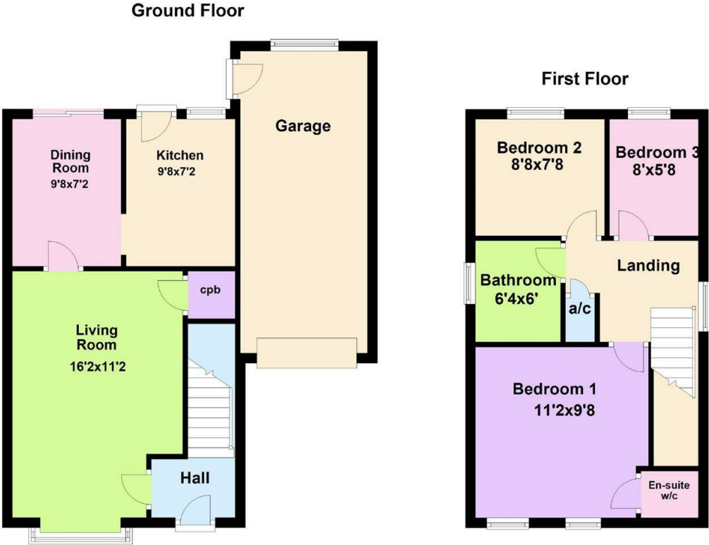
Floor plan not to scale - for guidance purposes only. Plan produced using PlanUp.