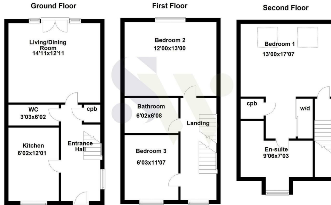
Floor plan not to scale - for guidance purposes only. Floor plan created by Simpson West for their use. Plan produced using PlanUp.