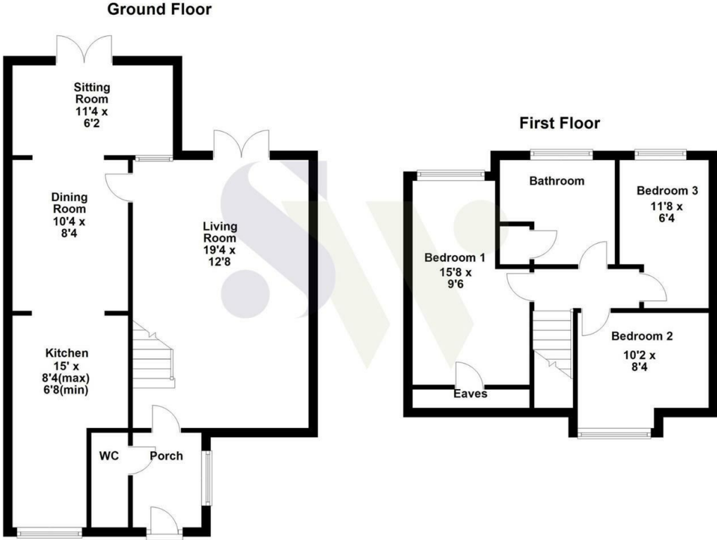
Floor plan not to scale - for guidance purposes only. Floor plan created by Simpson West for their use. Plan produced using PlanUp.