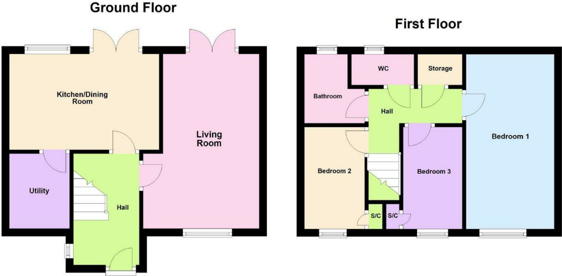
Floor plan not to scale - for guidance purposes only. Plan produced using PlanUp.