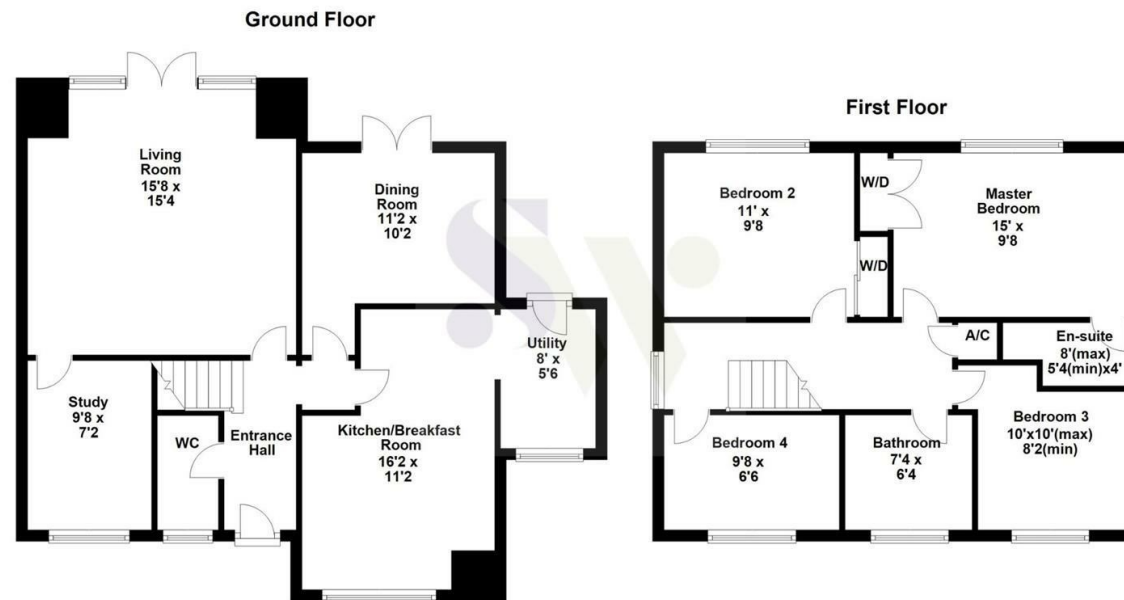
Floor plan not to scale - for guidance purposes only. Floor plan created by Simpson West for their use. Plan produced using PlanUp.