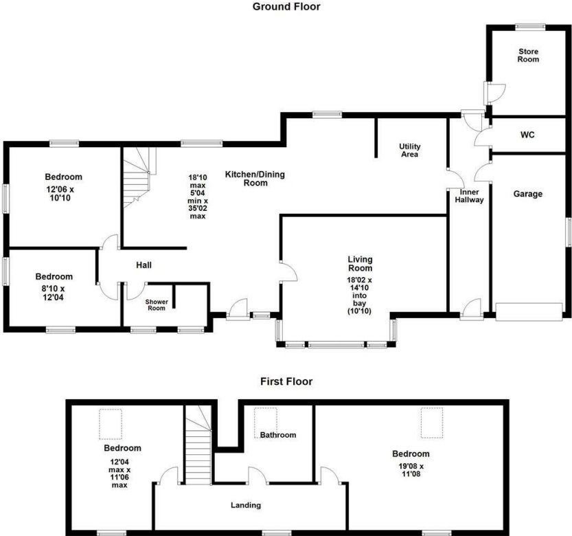
Floor plan not to scale - for guidance purposes only. Floor plan created by Simpson West for their use. Plan produced using PlanUp.