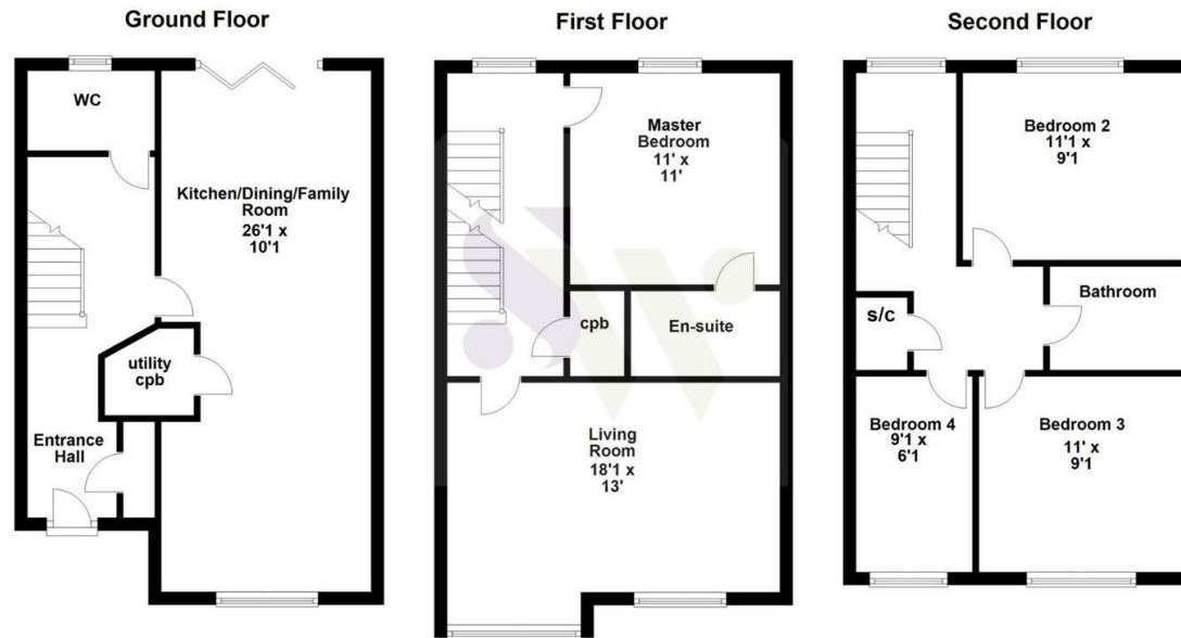
Floor plan not to scale - for guidance purposes only. Floor plan created by Simpson West for their use. Plan produced using PlanUp.