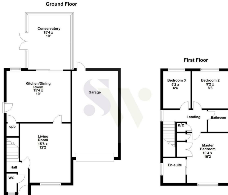
Floor plan not to scale - for guidance purposes only. Floor plan created by Simpson West for their use. Plan produced using PlanUp.