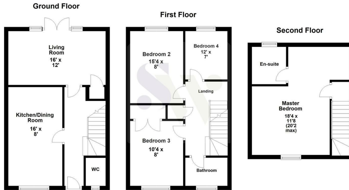
Floor plan not to scale - for guidance purposes only. Floor plan created by Simpson West for their use. Plan produced using PlanUp.