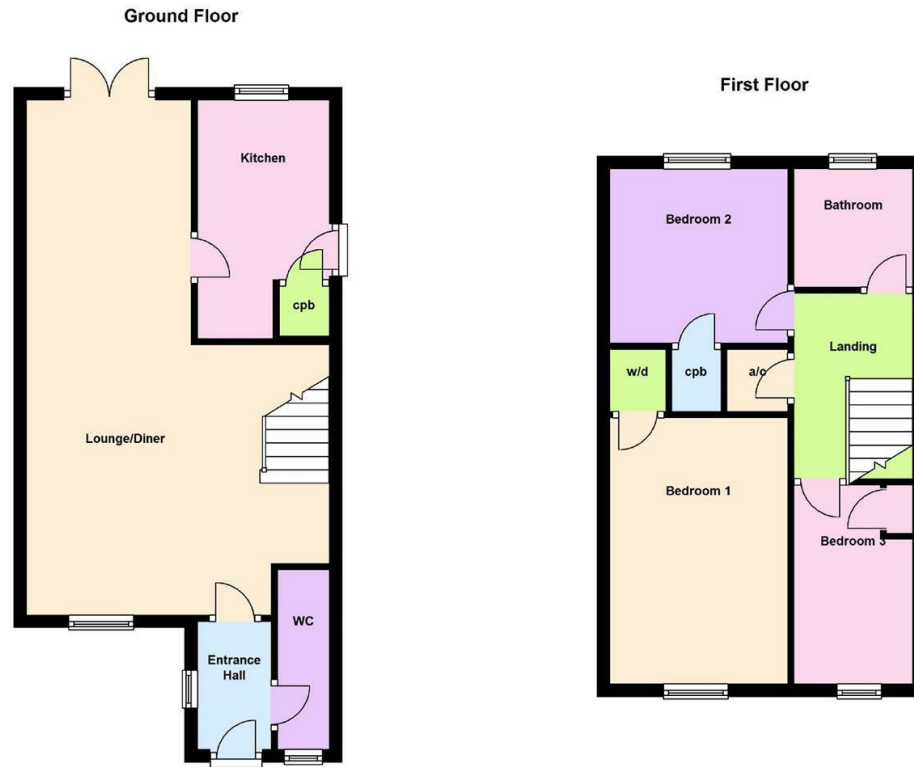
Floor plan not to scale - for guidance purposes only. Plan produced using PlanUp.