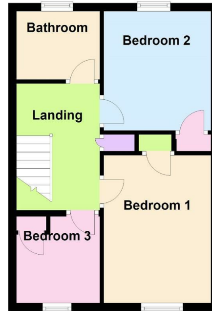
Floor plan not to scale - for guidance purposes only. Plan produced using PlanUp.