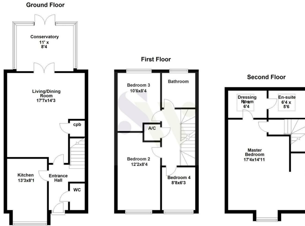
Floor plan not to scale - for guidance purposes only. Floor plan created by Simpson West for their use. Plan produced using PlanUp.