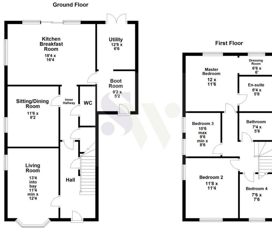
Floor plan not to scale - for guidance purposes only. Floor plan created by Simpson West for their use. Plan produced using PlanUp.