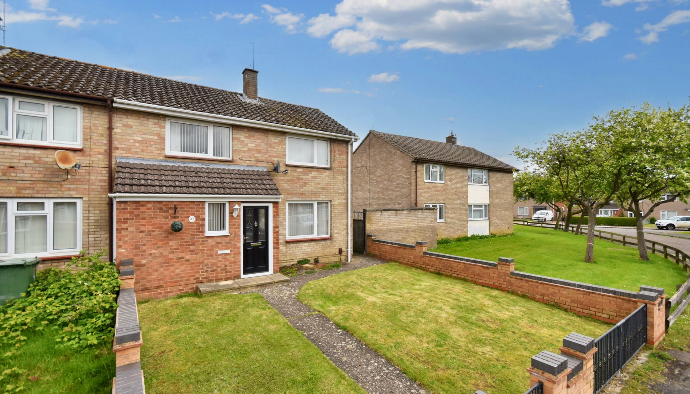
2 Gateford Court Corby, NN18 0AQ