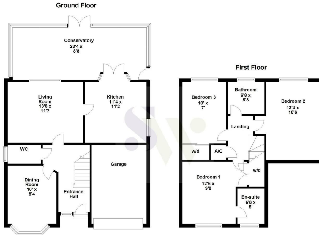
Floor plan not to scale - for guidance purposes only. Floor plan created by Simpson West for their use. Plan produced using PlanUp.