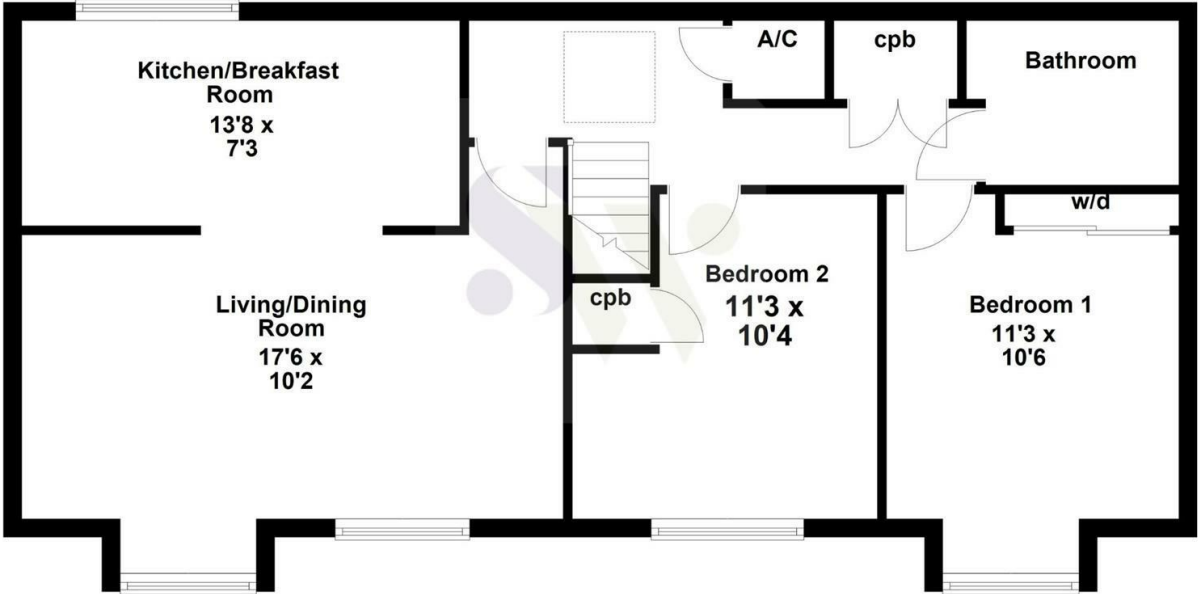
Floor plan not to scale - for guidance purposes only. Floor plan created by Simpson West for their use. Plan produced using PlanUp.