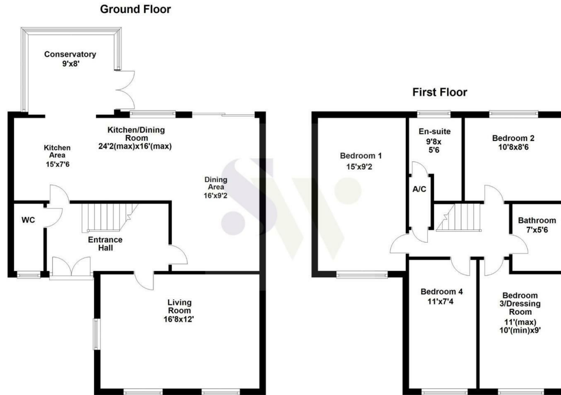
Floor plan not to scale - for guidance purposes only. Floor plan created by Simpson West for their use. Plan produced using PlanUp.