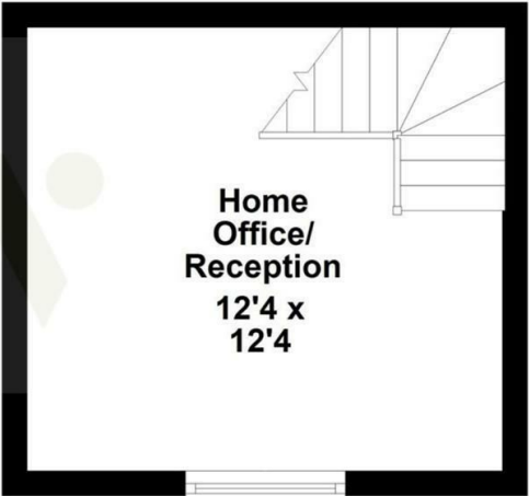
Floor plan not to scale - for guidance purposes only. Plan produced using PlanUp.