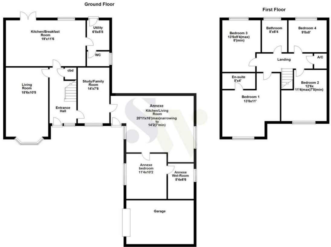
Floor plan not to scale - for guidance purposes only. Plan produced using PlanUp.