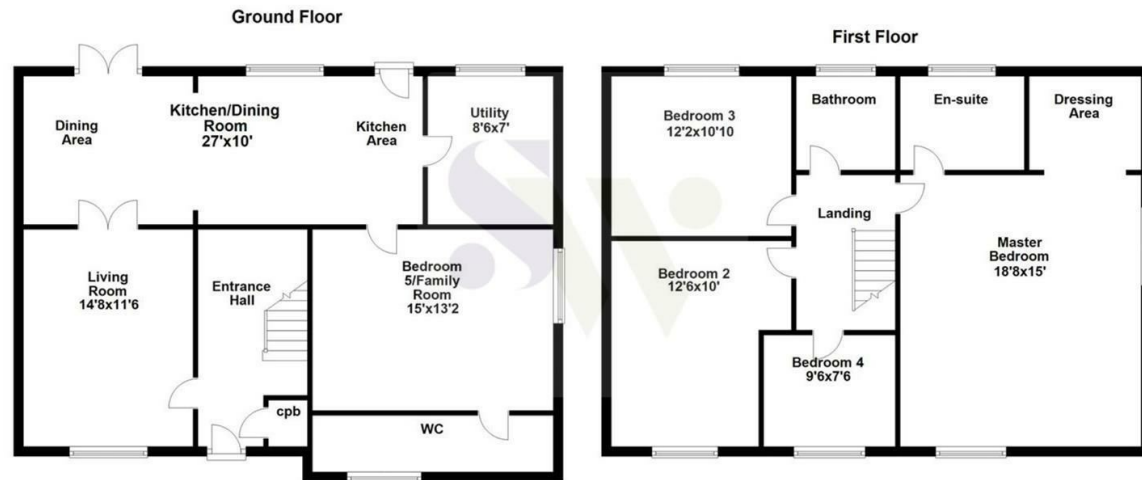
Floor plan not to scale - for guidance purposes only. Plan produced using PlanUp.