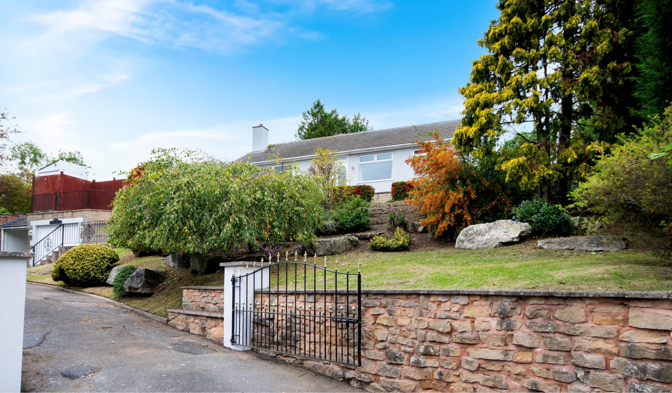
MONTE LEMA, PARK LANE, ELKESLEY £400,000