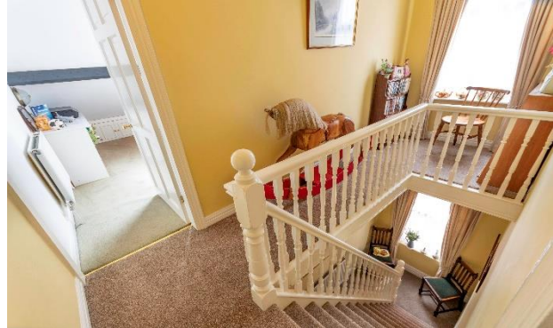
Landing second floor