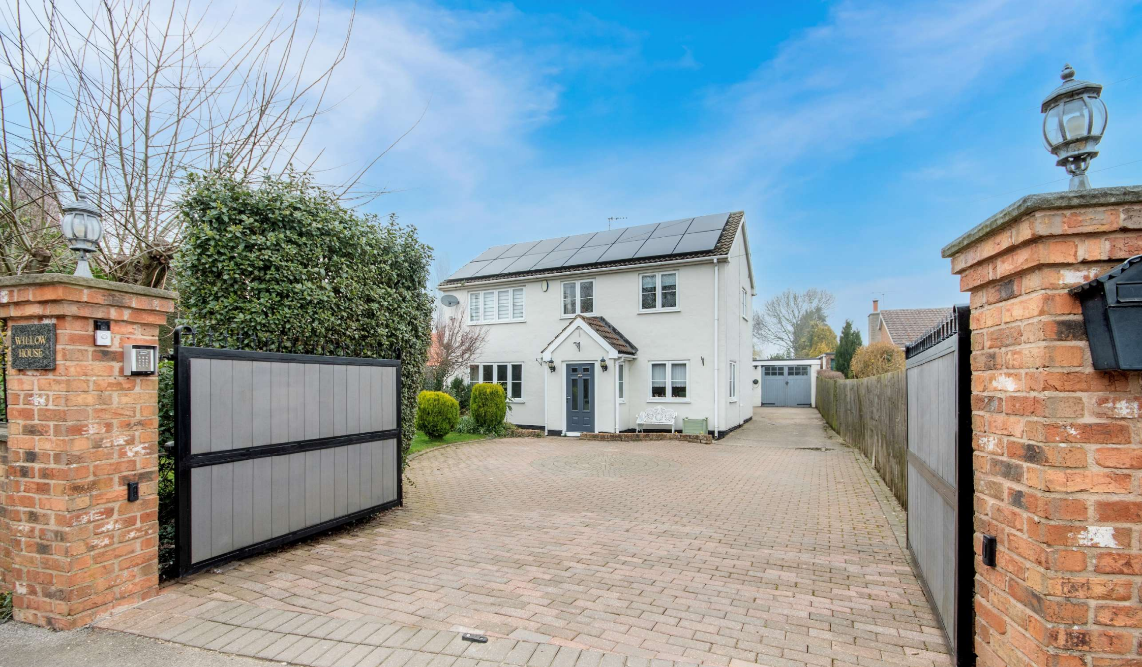
WILLOW HOUSE, EAST DRAYTON £500,000