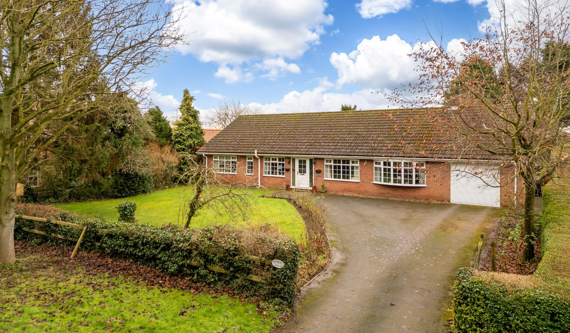
APRIL RISE, STURTON LE STEEPLE £495,000