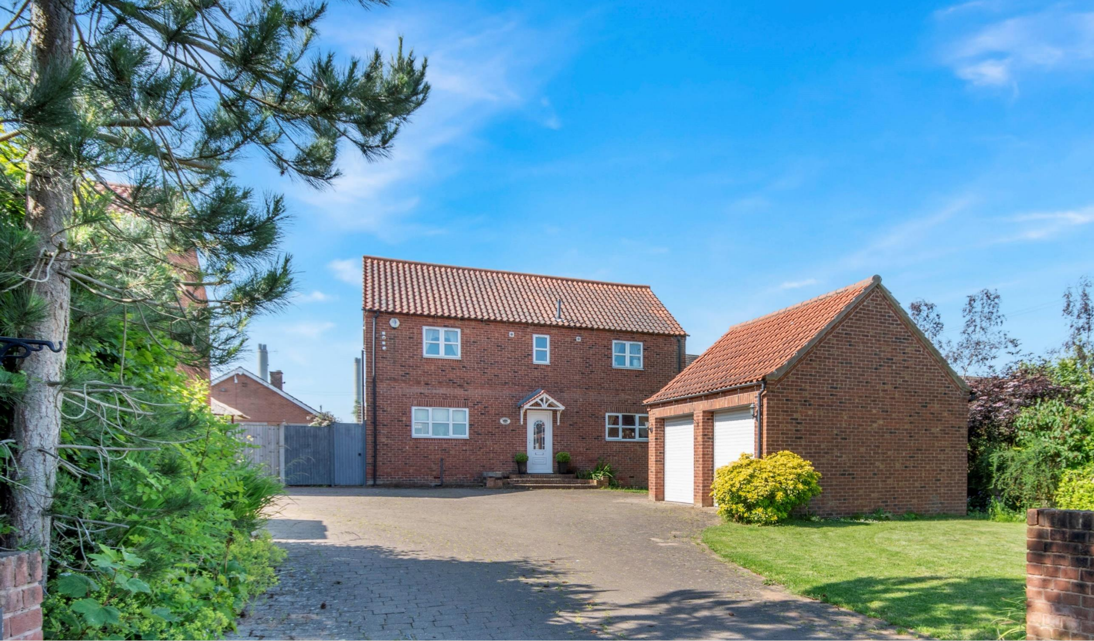
MEADOW VIEW, BOLE £450,000