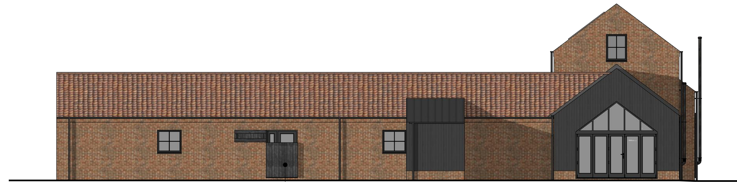
Rear Elevation Scale: 1:100