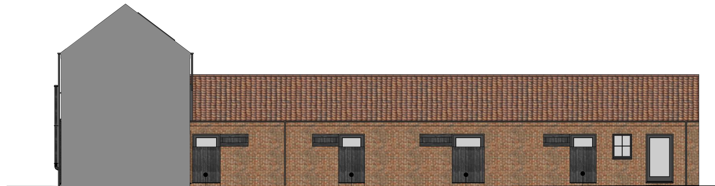
Courtyard Elevation - B Scale: 1:100

External timber doors to match existing. Openable to increase solar gains in winter and reduce overheating in summer.