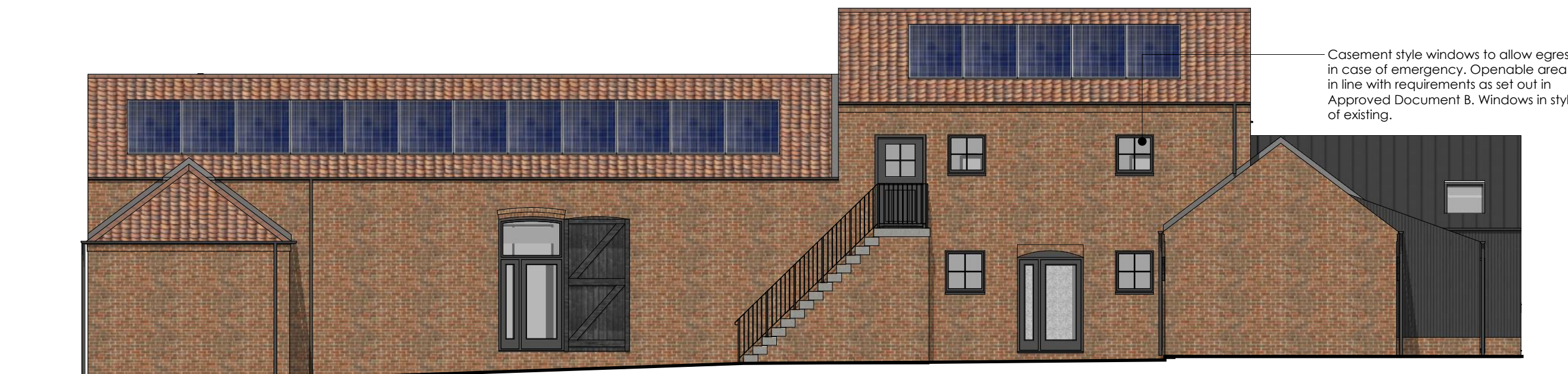
Side Elevation Scale: 1:100