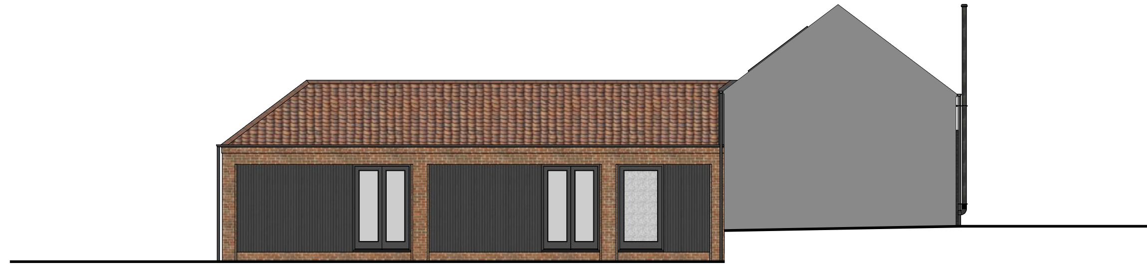
Courtyard Elevation - A Scale: 1:100