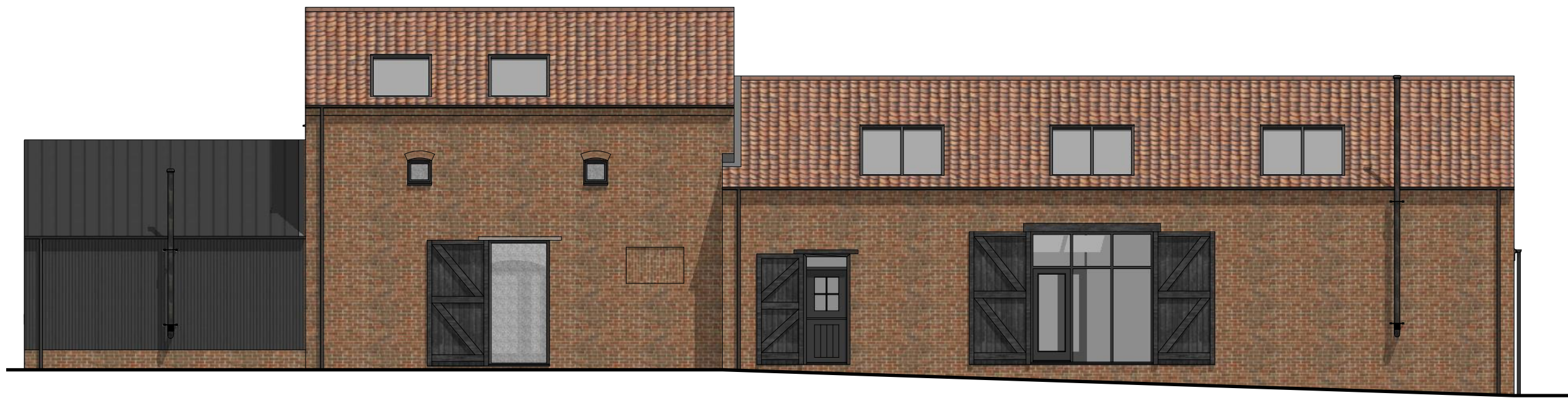
Side Elevation Scale: 1:100